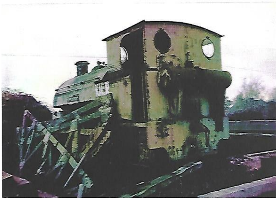
Two pictures of Kiers Loco, although taken at Setch, it was for use on Kier sites and had nothing to do with the Oilfields operation.